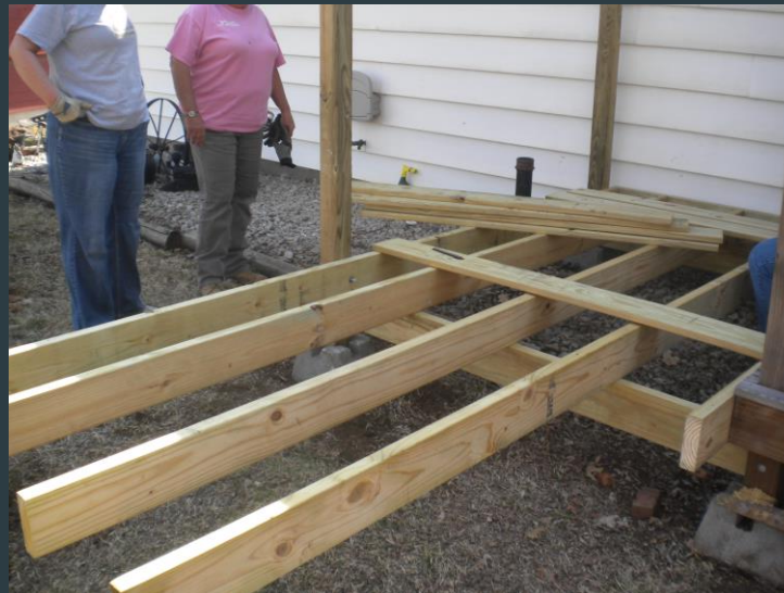
Laying out the ramp that is connected to the deck