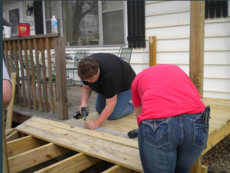
Screwing in 1 x 4's to the deck