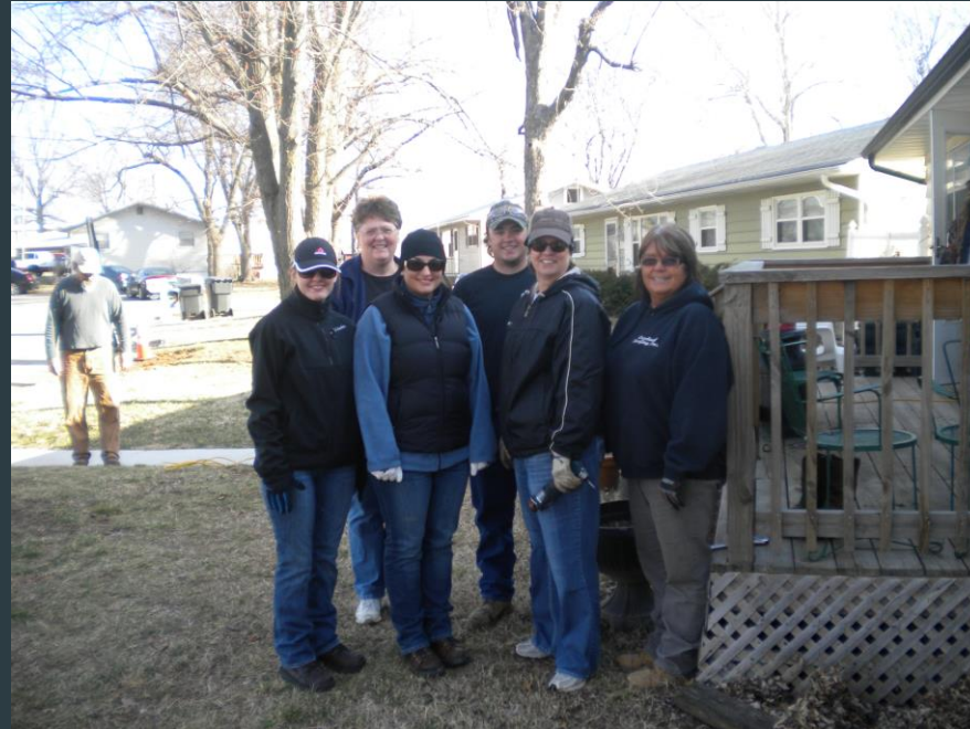
NAWIC Southwest Chapter #366 starting the morning.