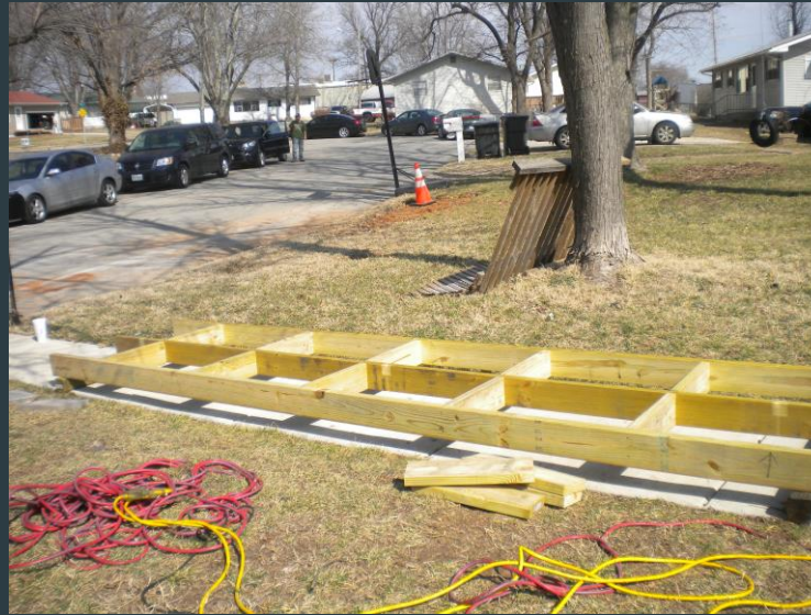
Constructing the ramp