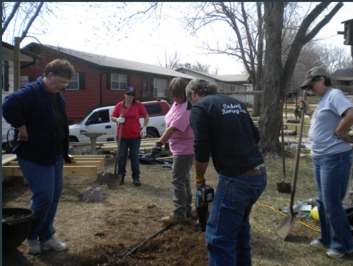
The team struggles cutting out the roots that are the size of basketballs