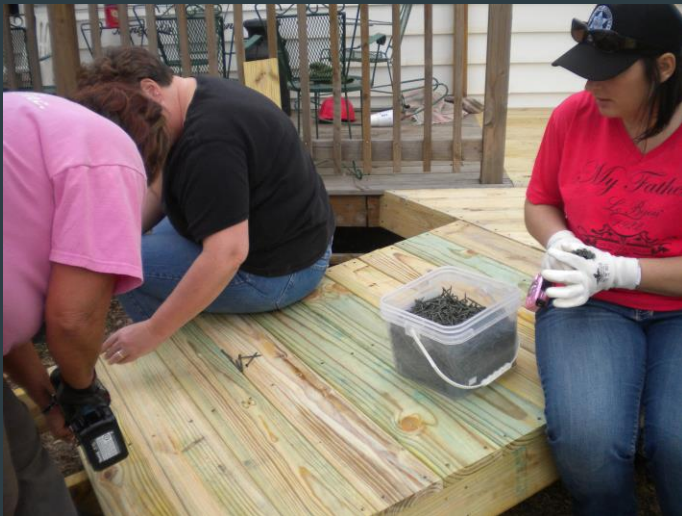
Screwing in 1 x 4's to the Ramp