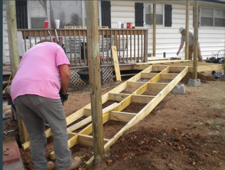
Digging holes as deep as 12”