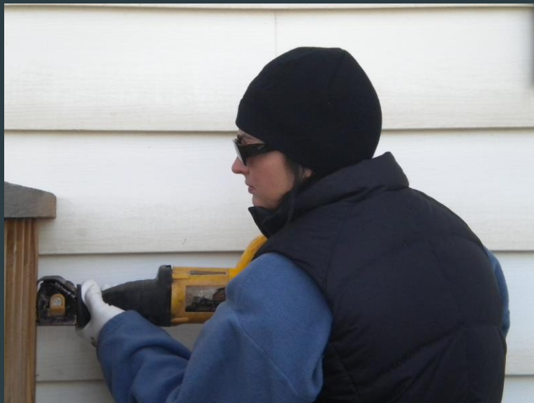
April taking out the side deck